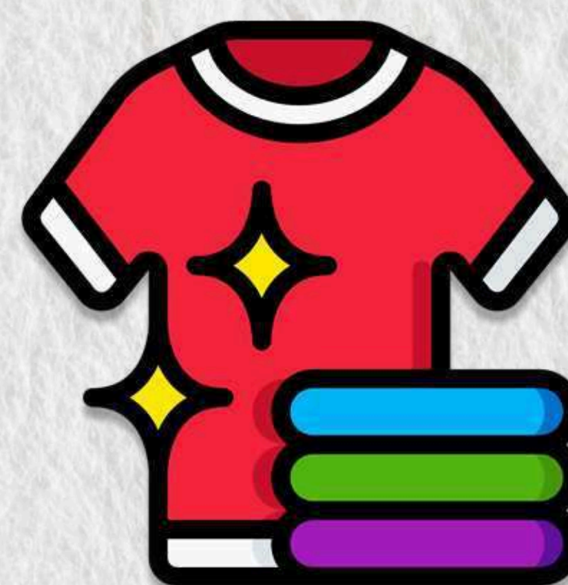
Extra pair of clothes